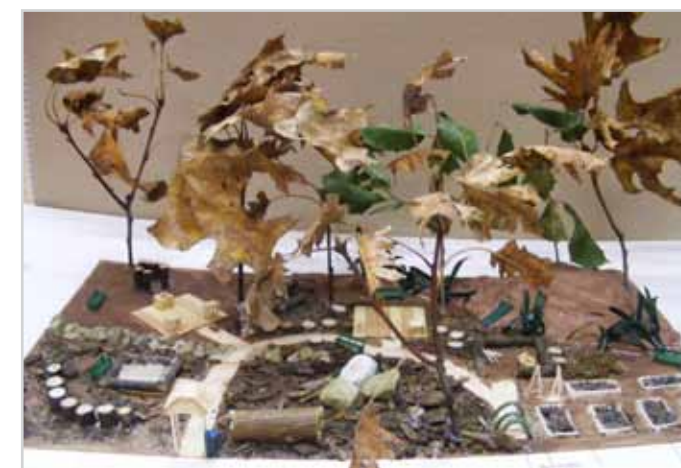
Concept Plan (top) and Model (bottom) of Natural Play Area