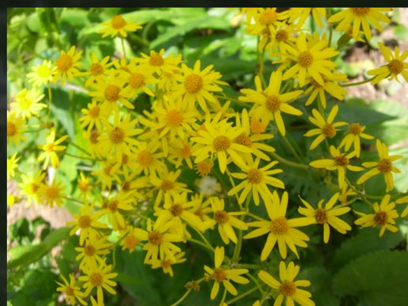
Golden Ragwort ( Packera aurea )

The Oregon Ridge woodland garden will be a protected space within the park where guests will be able to observe the natural beauty of Maryland native plants. There will be labels and descriptions of each plant as well as information on the ecological benefits of keeping native plants. The Garden will have several entrance points, a meandering path, and locations where guests may sit and enjoy the wildlife within the garden.