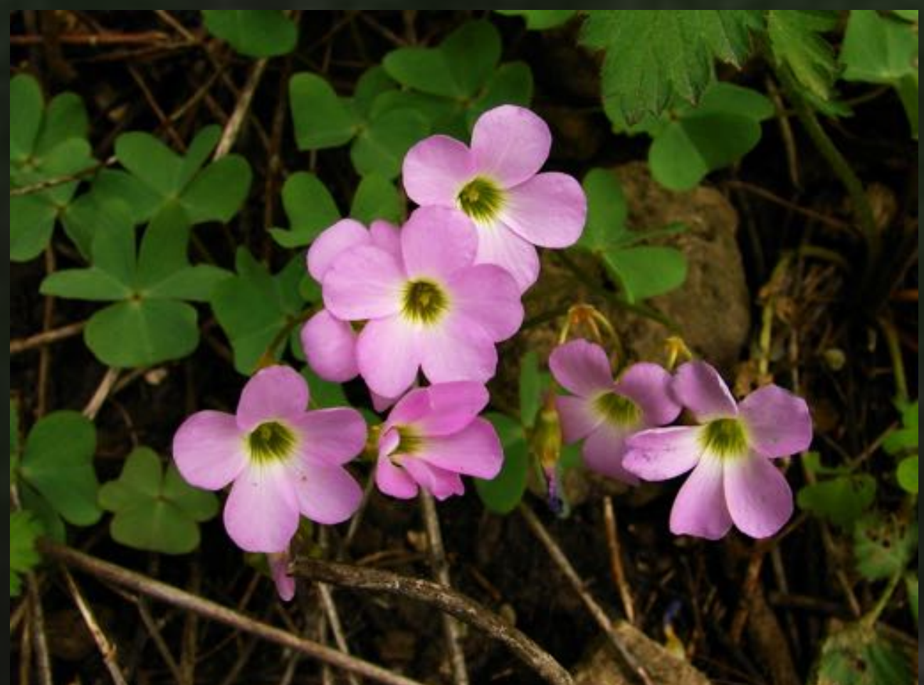
Violet Wood Sorrel ( Oxalis violacea )