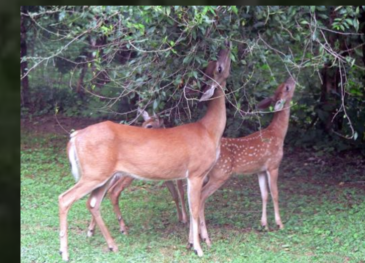
White-tailed deer ( Odocoileus virginianus ) grazing from a tree

The forest in the photo to the left has had its understory vegetation cleared due to the white-tailed deer in the area.