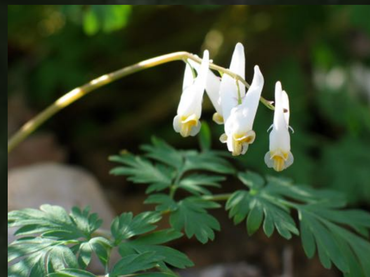
Dutchman's Breeches ( Dicentra cucullaria )