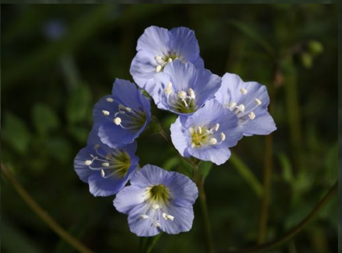
Sweatroot ( Polemonium reptans )

The wildflowers pictured above are just some of the many gorgeous plants that will grow within the dappled shade of the woodland garden. The garden will also be home to beautiful ferns, shrubs, and grasses native to the region.