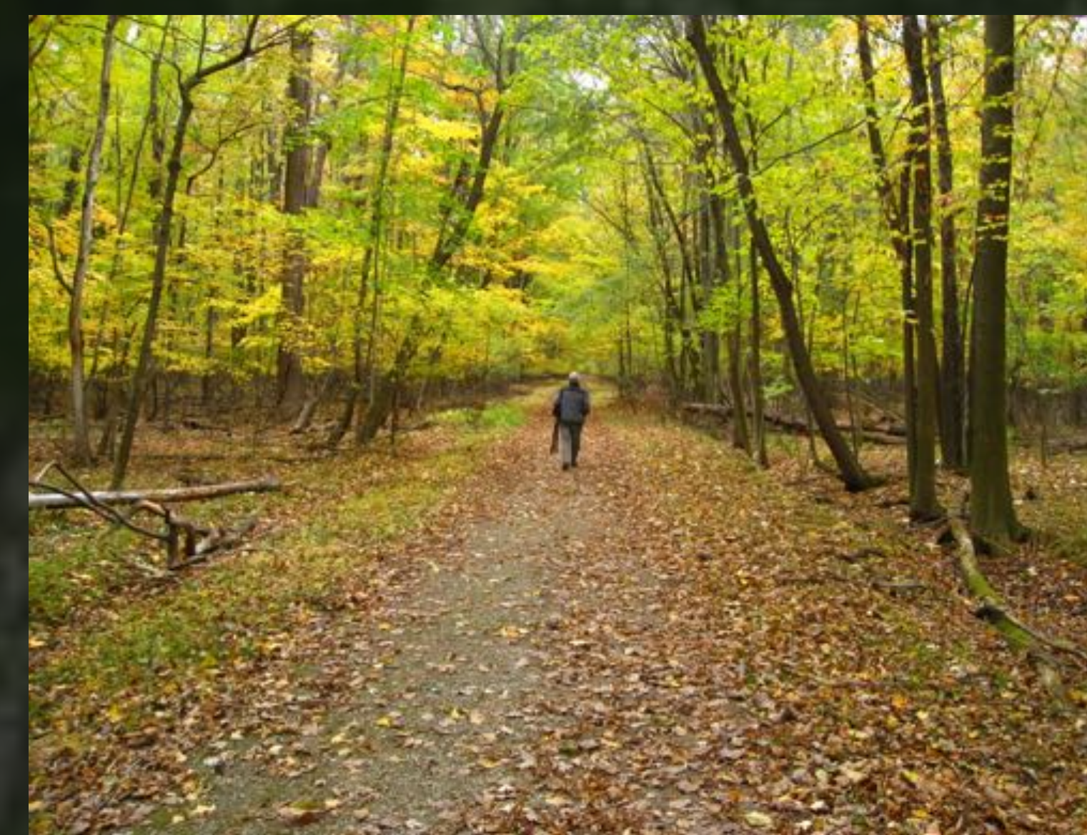
Deer Browse Line by Andy Jones

Unfortunately not all woodland dwellers are conducive to flourishing native gardens. White-tailed deer pose a particular threat to these gardens as they voraciously consume understory vegetation. Their eating habits negatively affect other animals within the ecosystem by removing important sources of food and shelter, for this reason the garden will be enclosed by a tall fence so that it may flourish unfettered by the grazing of white-tailed deer.