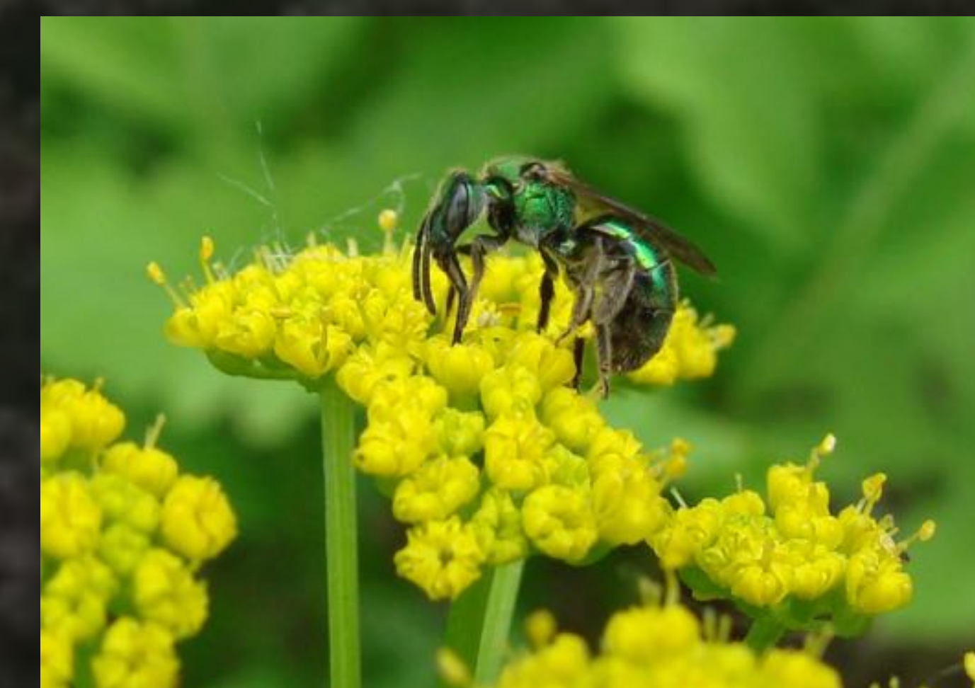
Sweat Bee ( Augochlorella aurata)