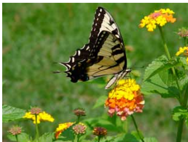
Adult Tiger Swallowtail

The Baltimore County Master Gardeners established the Historical Garden in 2009 in the Nature Center meadow. There are many types of flowers and shrubs planted to reflect gardens of yesteryears. This year, responsibility for this garden is being transferred to Oregon Ridge Nature Center Master Naturalists.