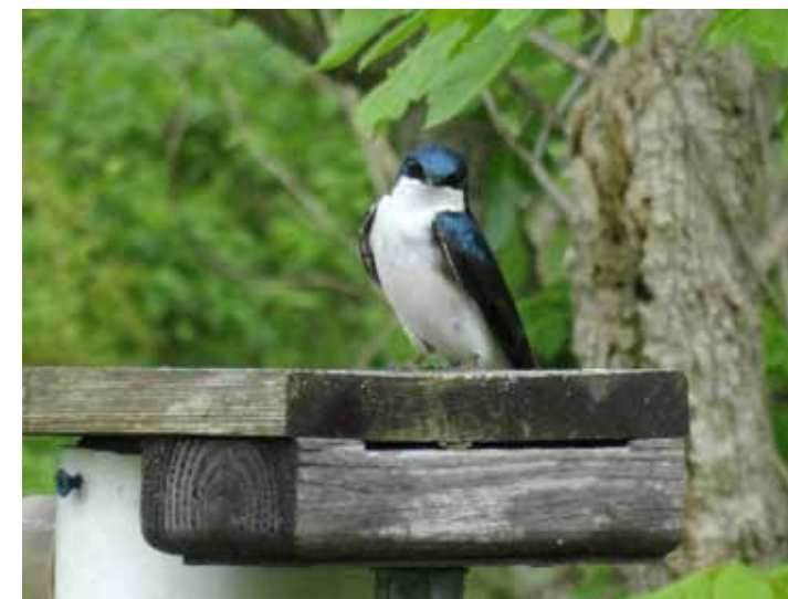
(Tree Swallow photo by Martha Johnston)

The nesting season at Oregon Ridge runs from April to late July. Bluebirds lay 2-7 eggs with a 12-14 day incubation period, which starts on the day when the next to the last egg is laid. The young fledge 16-22 days after hatching. Bluebird pairs may have more than one successful clutch in a season. Tree swallows lay 2-8 eggs in nests lined with feathers and incubate for 14-15 days; nestlings fledge after 16-22 days. For both bluebirds and tree swallows, males as well as females help feed and protect nestlings, although only females brood.