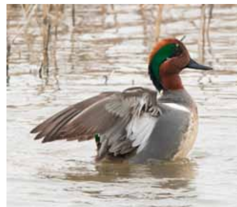
Green Winged Teal in late winter at Bombay Hook