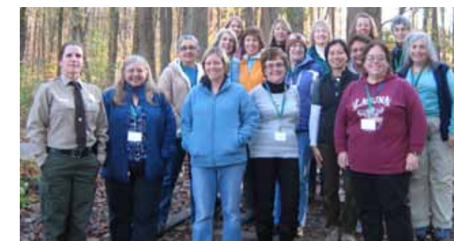
Master Naturalist Class from ORNC and Robert E. Lee Park to graduate Fall 2013