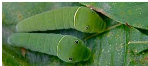
Tiger Swallowtail Caterpillars