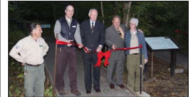
(l to r, Jamming at Music in the Woods, Planting Trees, Ribbon Cutting for Iron Ore Exhibit)

Looking back over the last year, there have been significant and substantial changes and improvements at Oregon Ridge Park and Nature Center due to the efforts of many people: