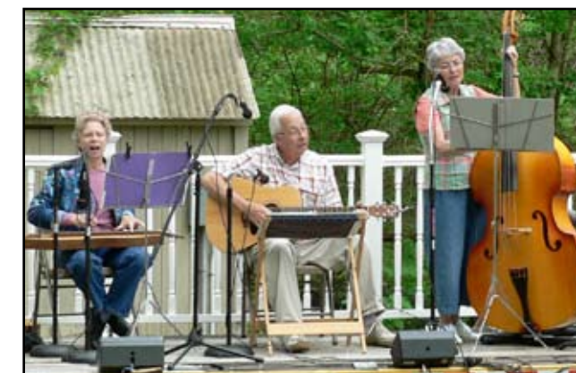
The Back Porch Players set a lively pace