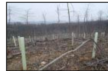
Gypsy moths devastate oaks at Oregon Ridge